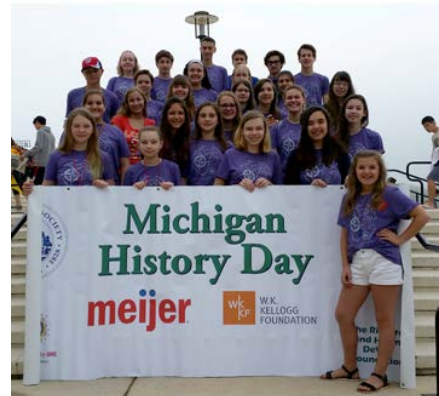
Seven Michigan students received special honors at this year’s National History Day competition that took place June 12-16 in College Park, Md.