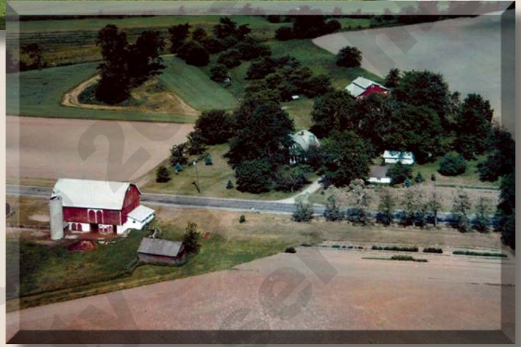
Below: An aerial view from 1999.

This Centennial Farm designation is sponsored by