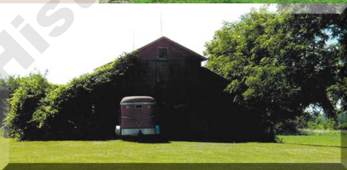
Left: The granary built in 1912.