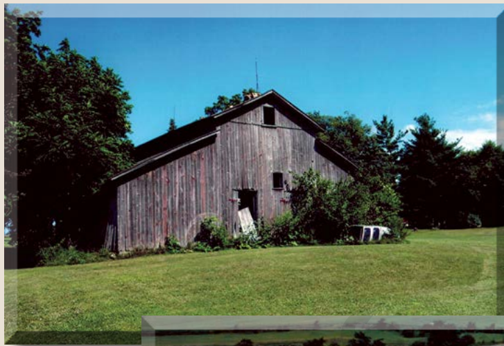
Left: The granary built in 1912.