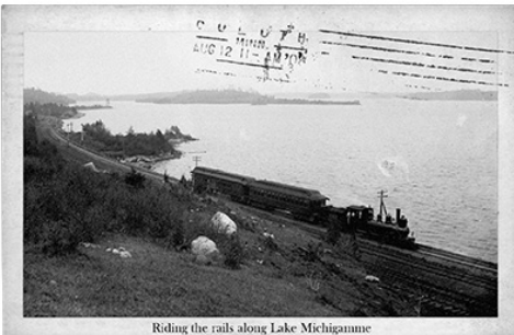
Riding the rails along Lake Michigan

The three-day conference also includes three keynotes: “In the Trenches: Soldiers’ Stories of WWI,” “Dollar-a-Day Boys: The Civilian Conservation Corps in Michigan,” and “Rum Rebellion: Prohibition Hits the U.P.”; 12 breakout sessions and four workshops; five tours; a wild rice camp; a picnic; and a banquet, where the U.P. History Awards will be presented; exhibitor tables; and networking opportunities.