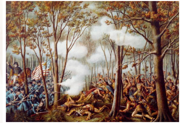
The Battle of Tippecanoe